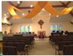
2015 Annual Report