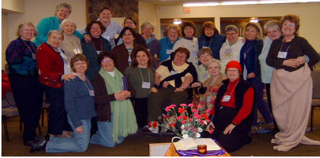
Women's Retreat, January 31, 2009