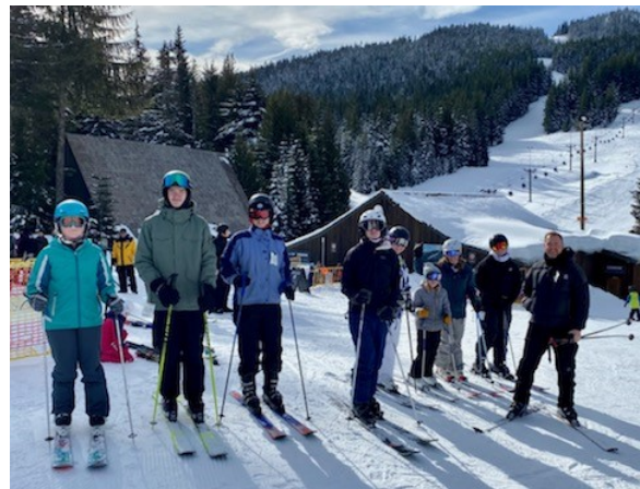
Ski trip - Saturday, February 26