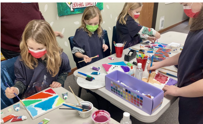
Sunday School Art