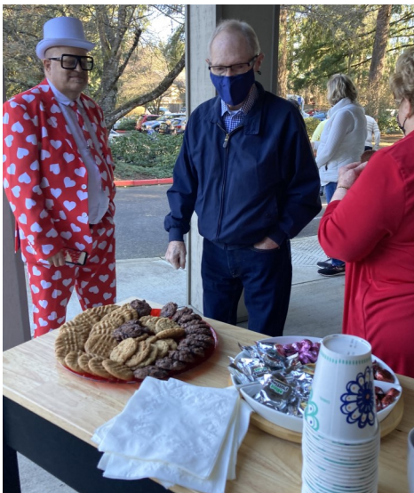
Left: after Worship - Cookies, coffee and fellowship.