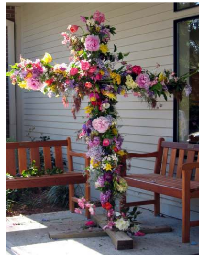
Easter Sunday - "He is Risen Indeed"