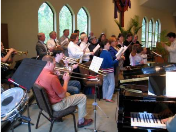
Music on Palm Sunday