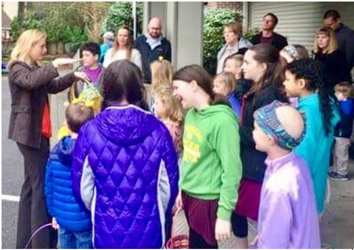
Getting ready for Easter Egg hunt