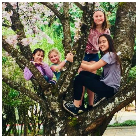
Youth up a tree