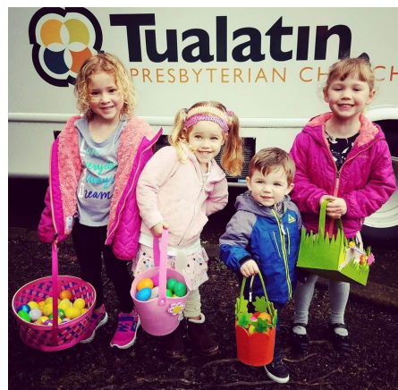
Preschool Easter Egg Hunt