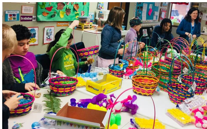
Assembling Easter baskets as Community Service Project for the Good Neighbor Center in Tigard.