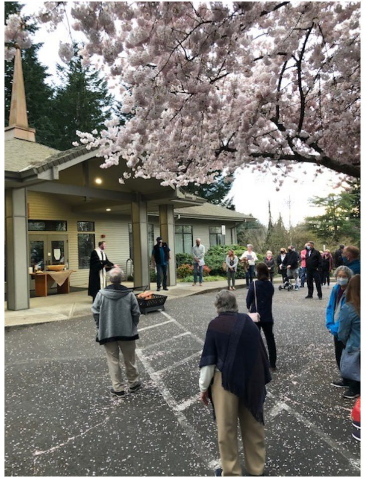
Easter Vigil, Saturday, April 3, 2021