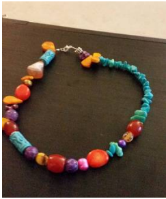
Mother's Day necklace