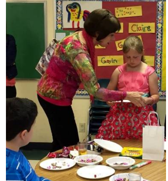
Kids working on their necklaces