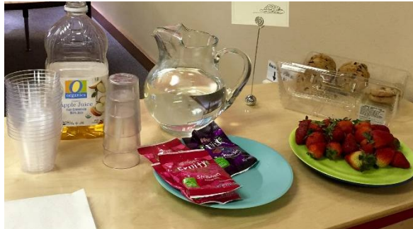
Our first kid's coffee hour