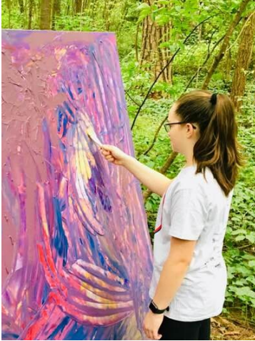
Sunday School Project

This mighty team of twelve ran 199 miles starting at 7:30 am on Friday, August 23 from Mt. Hood.