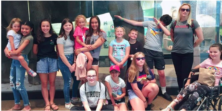
Summer Program Camp