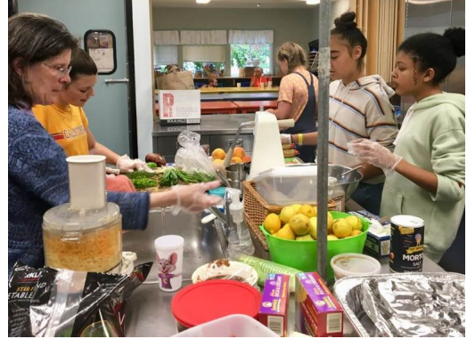
Middle School Log College