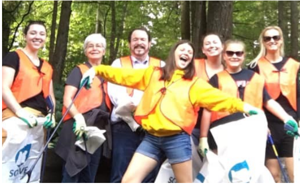
Middle School Mission - collecting trash