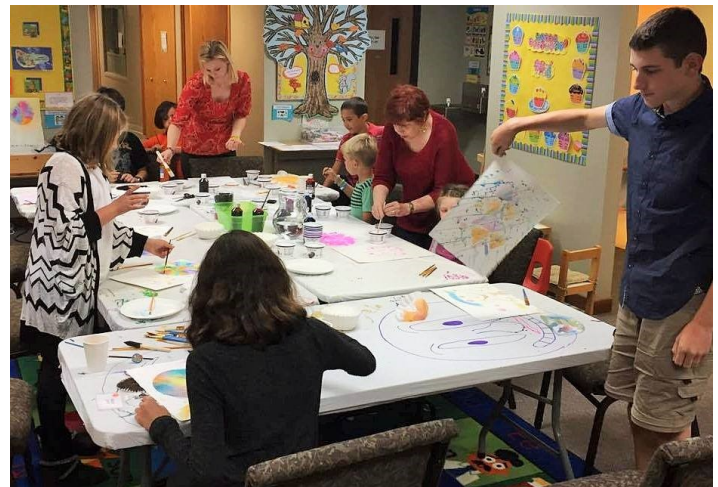
Sunday mornings downstairs at TPC

This national program has an 87% success rate of getting families situated so that they attain sustainable housing. Here is an opportunity to bring about real change for families and children who have lost their homes.