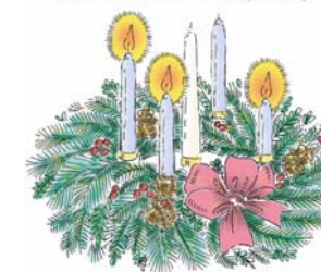
Advent Candle Lighting