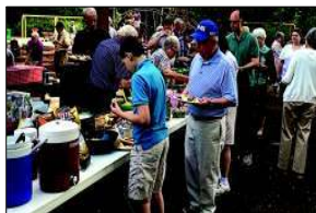
ALL-CHURCH PICNIC June 2014

'For where two or more are gathered in my name, I am there among them.' Matthew 18:20