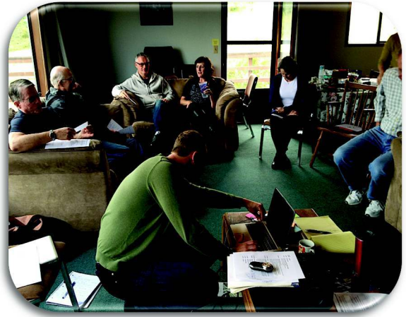
2014 Session Planning Retreat

Congregational elections occur annually in March. Ruling elders serve three-year terms by classes. Each elder is assigned a special area of responsibility. A session retreat is held annually in the fall to vision and plan for the coming year.