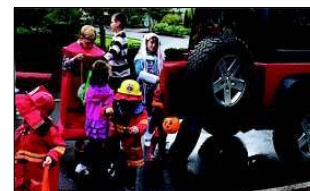
TRUNK OR TREAT October 2014