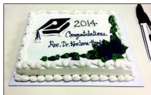
CELEBRATION OF THE REV. DR. May 2014