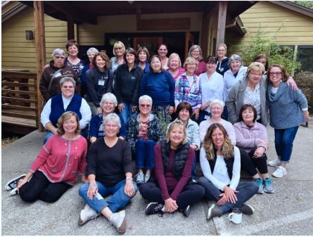
Love like God