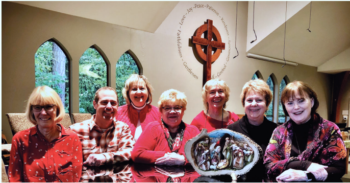
Believe in one another