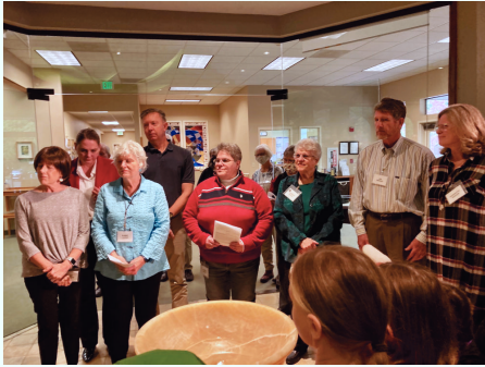
Help one another